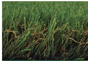
A CLOSER LOOK