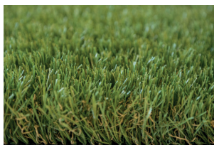
A CLOSER LOOK