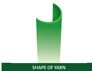
SHAPE OF YARN