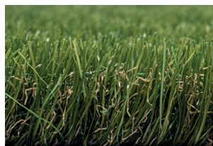
A CLOSER LOOK