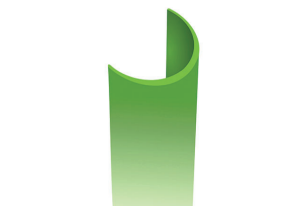
SHAPE OF YARN